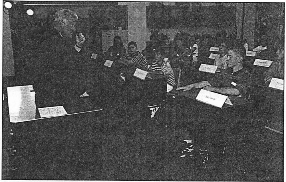
Clinton in the classroom: "Transformation" agenda an OBE nightmare in the making.

However, before the exultant legislators could pop the champagne corks and raise a celebratory toast to their bipartisan "victory," a disturbing phenomenon arose to upset the jollity. In spite of enjoying near universal support among the patricians on the Potomac, the proposed legislation was igniting a firestorm of opposition among the plebeians in the hinterlands. As one leading House Republican who had voted for the measure later noted, "A grassroots rebellion is